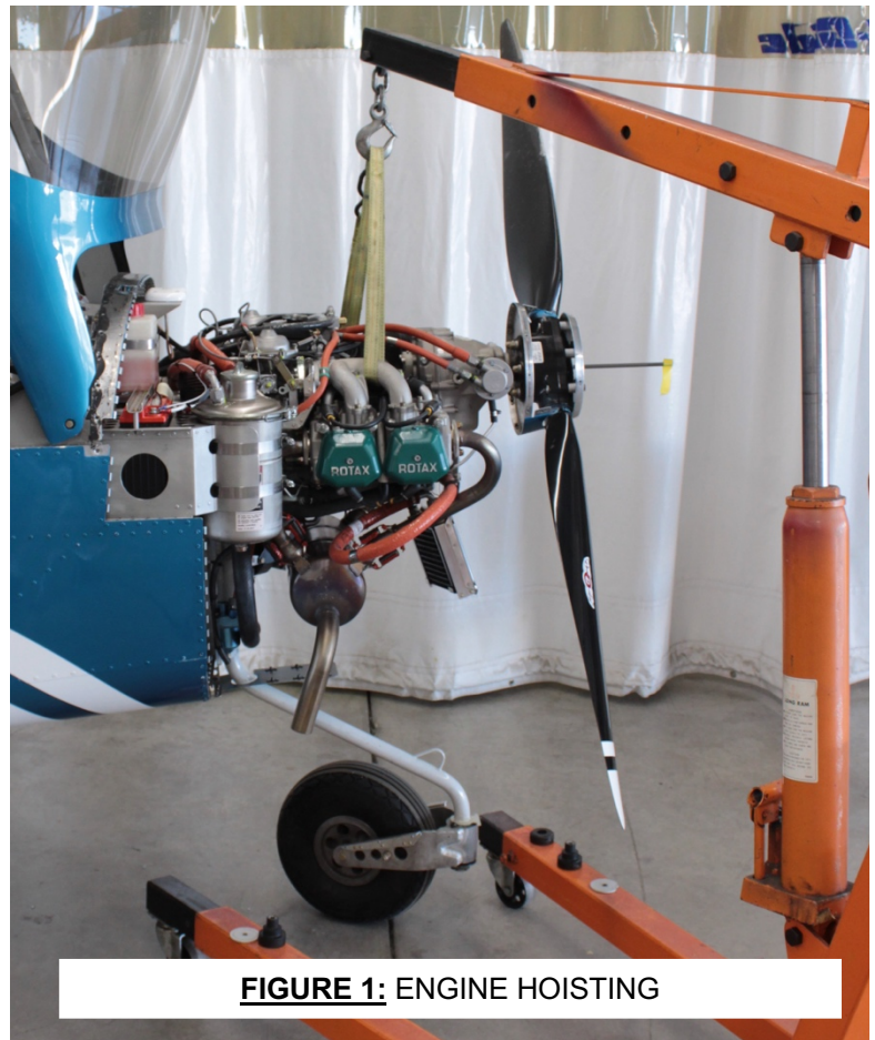
FIGURE 1: ENGINE HOISTING

Step 11: Temporarily attach the WD-1201-1 Nose Gear Leg to the fuselage using the four bolts shown in Figure 2.