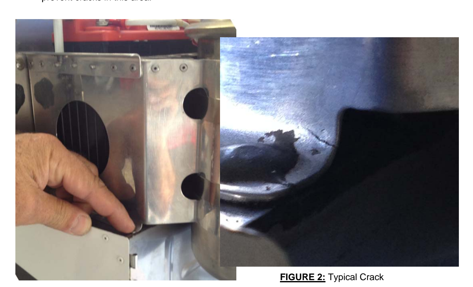
FIGURE 1: Crack Location

Cracks have been found in the F-1201E-L & -R Oil Tank Side Brackets at the location shown in Figures 1 & 2 below. Installation of an extra F-1201G-MOD Rib is required to prevent cracks in this area.